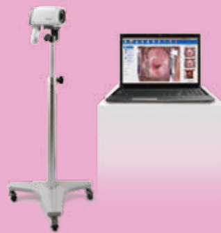
C3A/C6A Video Colposcope