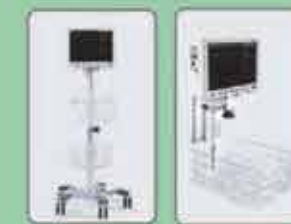
Rolling Stand Wall Mount

Standard Parameters: 3/5-lead ECG, RESP, EDAN SpO 2 , NIBP, PR, 2-TEMP Optional: 2-NIBP, Respironics CO 2 , EDAN G2 CO 2 , Thermal Recorder, WLAN Accessory Kit