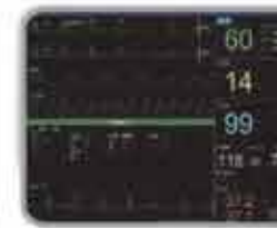
OxyCRG for Neonate