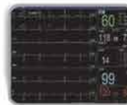
3/5-lead ECG Analysis