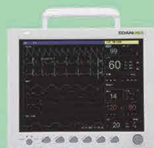
iM8 Series Patient Monitor