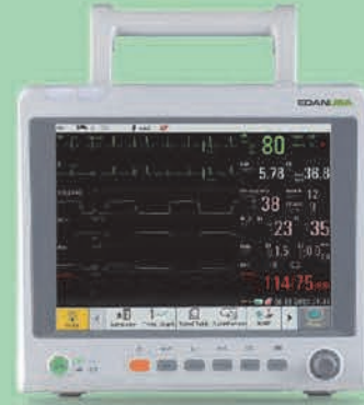
iM70 Patient Monitor